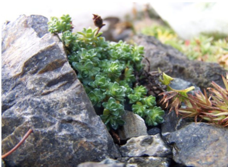
Photos this page ssp smalliana from Swick garden, Anchorage