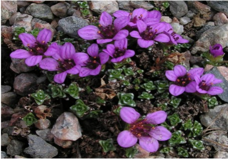
In habitat in the Swiss Alps, photo NARGS archives