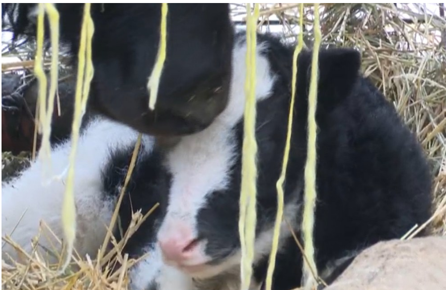
Baby Tibetan Yak born at the Alaska Zoo, March 2025

As with all animal manures, yak dung should be aged or composted before use. However, if you don't want to wait to compost it, you can also create a nutrient-rich "tea" by steeping yak dung in water and using the diluted solution to water plants that will not be used for food. Be careful not to make it too potent as it can burn the roots and foliage of your plants, especially seedlings and young plants.